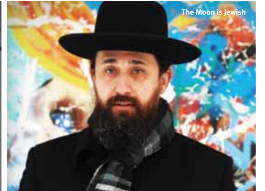
The Moon Is Jewish