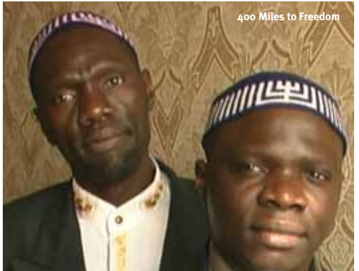
400 Miles to Freedom

NEW YORK PREMIERE MARY LOU EYTAN FOX | ISRAEL | 2010 150M | HEBREW WITH ENGLISH SUBTITLES Acclaimed Israeli director Eytan Fox ( The Bubble, Walk on Water, Florentine ) brings to life a modern fable with a catchy musical message and a story based on the songs of Israeli pop legend Svika Pick. Meir, a young man whose glamorous mother mysteriously disappears, searches for her in Tel Aviv. He learns about love with the help of the gay community and Israeli pop music while performing as a drag queen named Mary Lou. A cross between the TV series Glee and the musical Mama Mia , by way of La Cage aux Folles Israeli-style, Mary Lou garnered the equivalent of the Israeli Emmy Award for best mini-series. SAT JAN 14: 9:00PM